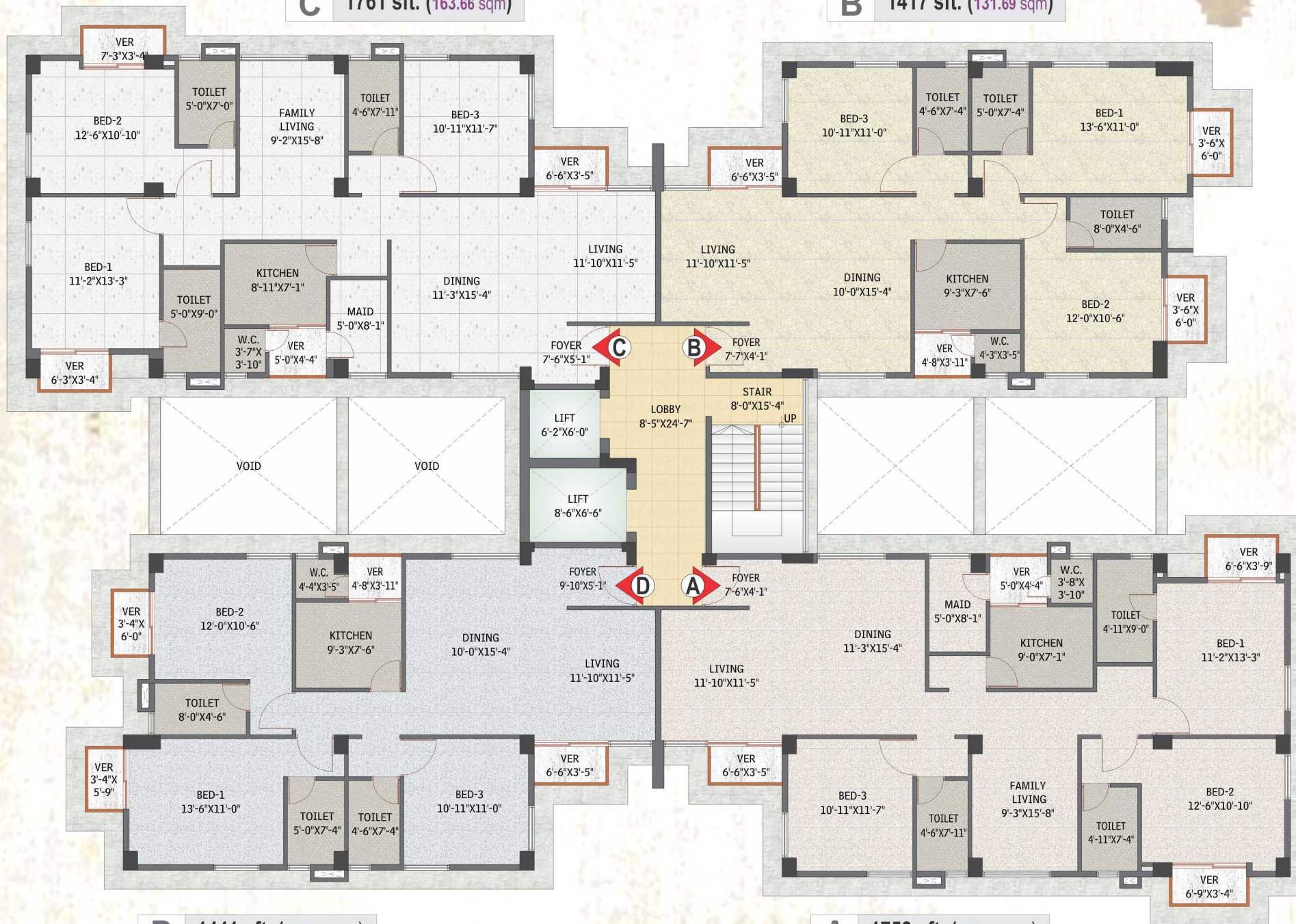
D 1441 sft. (133.92 sqm)